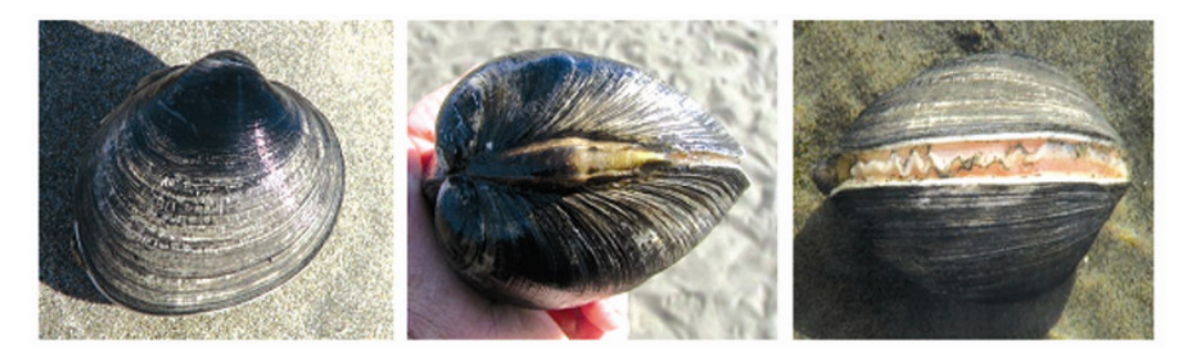
Fig. 1-Villorita Cyprinoides Var Cochinensis

they are capable of tolerating wide salinity changes (2-10\%_0) . They detect the presence of both known and unknown contaminants and also provide a temporally and spatially integrated measure of bioavailable pollutants. They can either detect exposure to and the toxic effects of parent compounds or integrate the toxicological interactions of mixtures of contaminants. The smaller size group has wider tolerance range than larger size groups; length range 10-42mm. Peak modes are 18-22mm and 24-28mm, of which the former is the dominant size group for the entire year<sup>13</sup>. They prefer sandy substratum with little amount of silt. These clams are used for human consumption apart from being used as an ingredient of prawn feed. The shell of this animal is widely used as a raw material for industries like cement and lime. This species have a peak spawning season in the monsoon i.e., from late May to August-September when salinity and temperature are considerably low. In addition to these characteristics they can act as short-term predators of long-term ecological effects through interactions into a suite of measurements and understanding at different levels of contaminations.