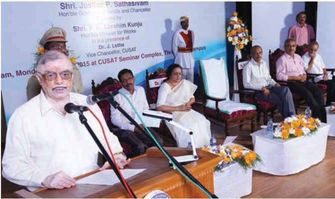
Address by Hon'ble Chancellor