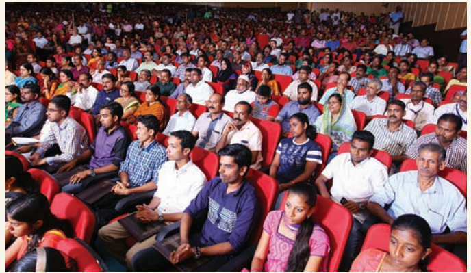
An attentive audience