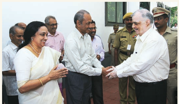
Pro-Vice Chancellor greets the Chancellor on his arrival