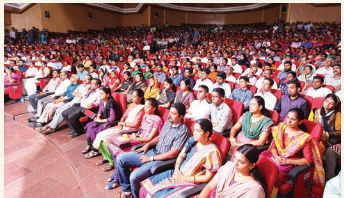
A view of the audience