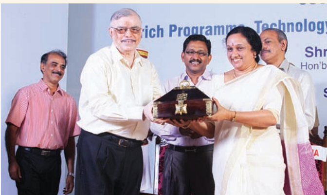
Presentation of memento to the Chancellor by the Vice Chancellor