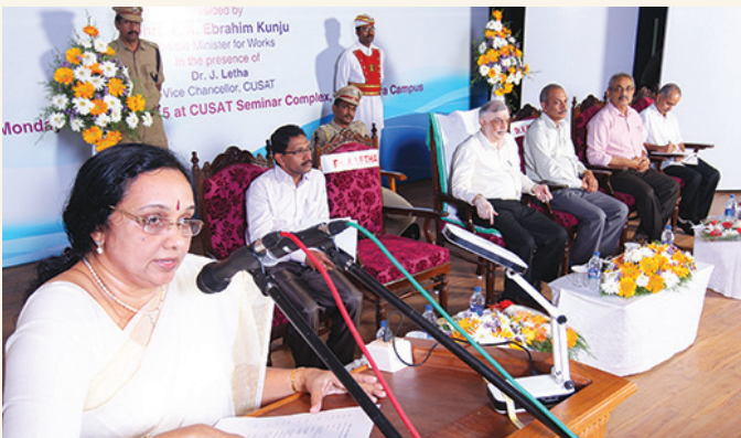
Address by the Vice Chancellor