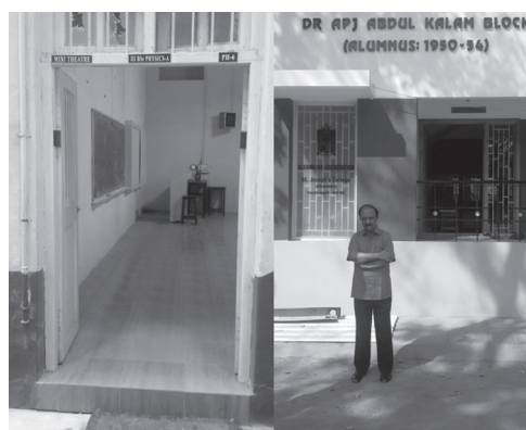
The author at St. Joseph's College

desire, belief and expectation. From the childhood itself he had fascination towards the mysteries of the sky, the flight of birds, which inculcated in him a spirit of enquiry, which finally made him learn the fundamentals of aerodynamics. Kalam joined St. Josephs College, Tiruchirapally in 1950 opting Physics as the main course of study though mathematics also was his favourite. Moving to Madras Institute of Technology (MIT) he had the first chance to see the various sub systems of flying machines which encouraged him to focus his studies more on aerodynamics and its engineering aspects. His first article was in Tamil language entitled ‘Let us make our own aircraft’. Surprisingly later he made an unsuccessful attempt to join the Indian Air Force.