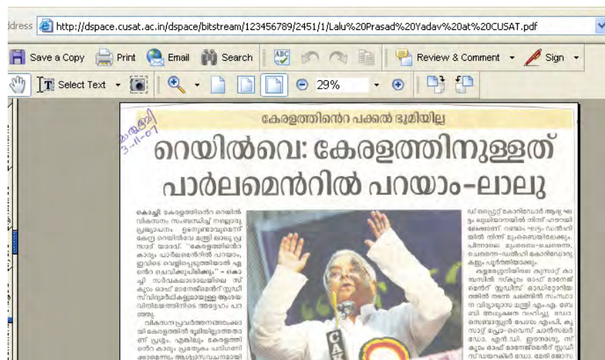
Figure 6: News Item in local language in DSpace

Here each community can build data relevant to them. The first task of archiving news in DSpace is the creation of a Sub Community named “News and Views” in each Community. Within this Sub Community, we can create “Collection” with suitable name. In each collection we can store individual news items. The responsibility of collecting/identifying required news and views from newspapers can be assigned to a staff member in each Community. The process of scanning the item, saving it in pdf, the work of uploading the item to Community collection, providing abstract, giving keywords and keeping file backups can be done either by a central agency or by the respective Community.