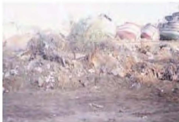
Figure 1. Complete devastation of the coastal belt in Nagapattinam.

Marine sediments fringing the coast of India exhibit well-defined patterns in their texture, chemical and min-