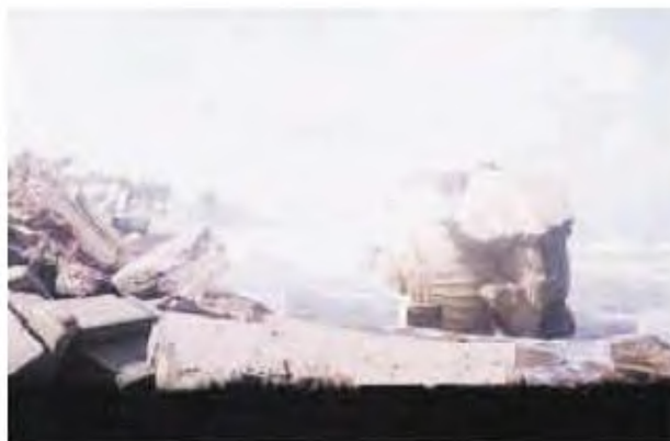
Figure 3. Tarangampadi temple site after the tsunami.

eral composition 3 . Most of the sediment depositions were observed 0.2 km away from the coast and maximum sediment inundation was noticed at the coastal beaches of Nagapattinam. These sediments were fine in nature and