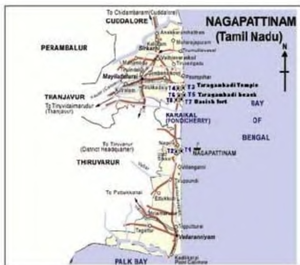
Figure 2. Sampling location (not to scale) of Nagapattinam District.

E, Echinoderm larvae; L, Larval max; I, Infacenal community impacts, and M, Microtox.