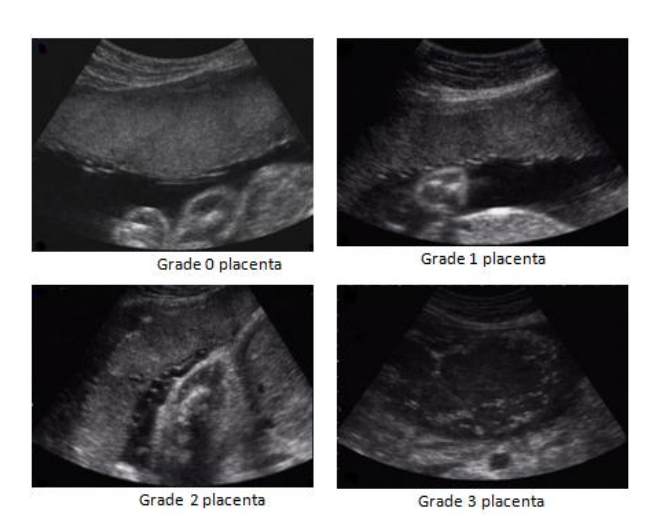
Fig. 1: Sample images of ultrasound placenta in different grades

The rest of the paper is organized as follows. Section 2 describes the speckle noise in ultrasound images and different noise reduction algorithms that are considered in this study. The proposed algorithm is also given. In section 3 result analysis using ultrasound images and discussion are presented. Conclusion and future work are given in the final section.