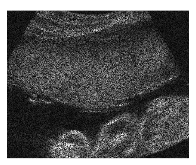
Fig. 3: ultrasound image corrupted with speckle noise

ranging from 3.5 to 5 MHz. Machine settings were optimized to ensure that, the images taken are good in were quality. The examinations conducted transabdominally by an experienced radiologist. The despeckling process is carried out on a personal computer with Intel core 2 Duo processor of 2.93 GHz speed with 4.00 GB RAM. The algorithm is implemented using Matlab 7 with Windows 7 as operating system. Initially, the well known median filtering has been applied to make the ultrasound image noise free. To the noise free image, speckle noise of zero mean and variance 0.2 are added. Then the original image is reconstructed using despeckling filters. Figure 3 shows the example of a noisy image.