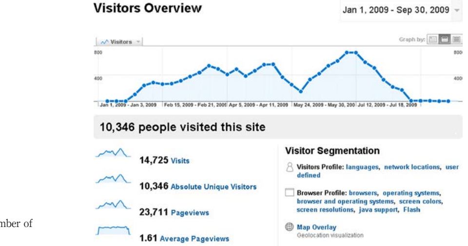
Figure 4. Statistics on number of visitors

The information on the use of a DL is an important element in measuring its value. A web-based DL will be visited by people from all across the world. The Google Analytics service can be employed as an important tool for obtaining data on the usage of DLs. The access statistics of CDL from January 2009 to September 2009 were collected using this service. The data is presented in Figure 4. In nine months, around 10,346 people visited the digital library, making 23,722 page visits. The country-wise