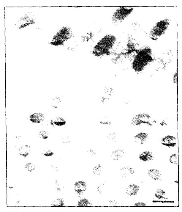
Fig. 3. Higher magnification of paracrystalline array of the viral particles showing both empty and full viruses. Scale bar = 100 nm.